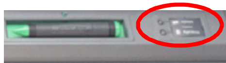
Pen Tray Buttons